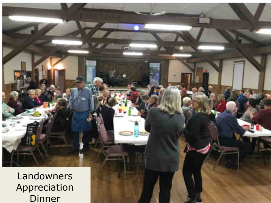
Landowners Appreciation Dinner

If you ever wanted to have 50 acres to call "your property", this is your chance. Each of the properties that we own or manage has a Land Steward and I am looking for one for this property. There will be other properties that will need a Land Steward, so if you are interested in this volunteer position please let me know. ◀