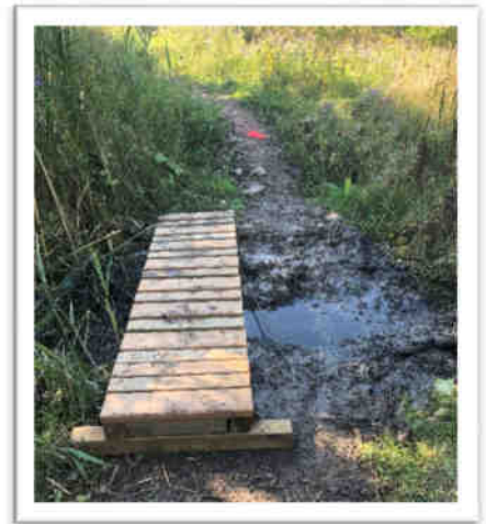
Above: The new boardwalk between Mewburn Rd. and the Screaming Tunnel.