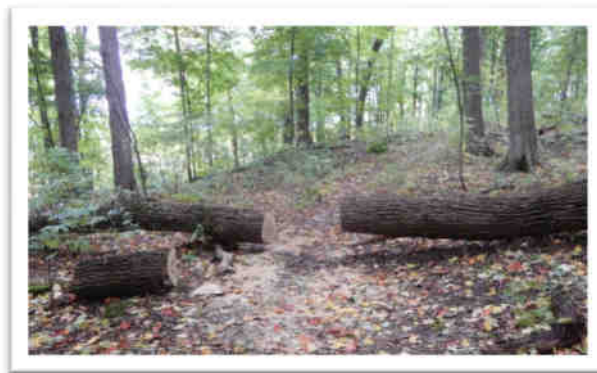
Photo at right: Trail Maintenance and Development - The chainsaw crew removed 18 trees from the trail in the last 3 months.