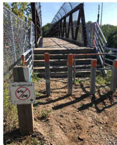
Completed work on pedestrian bridge at QEW