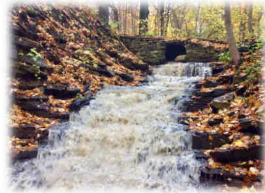
Above: Just west of 30 Rd, by Grimsby, October 27 th, after a heavy rain.

In closing, we are blessed with these idyllic surroundings and the best that Mother Nature has to offer. Let's look after it, keep it clean and stay safe. ◀