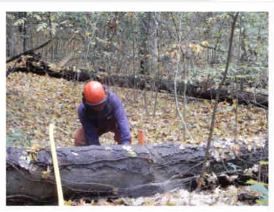
Below: The chainsaw crew at work over the last few months.